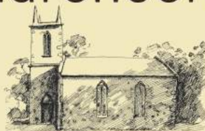
The Old Church Centre Cushendun