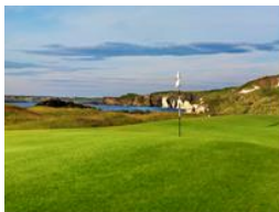
Royal Portrush Golf Club www.royalportrushgolfclub.com

Royal Portrush is the host venue for The 148th Open.